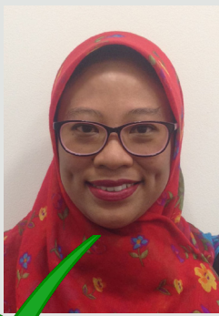
No shadows on facial features, no glare on glasses