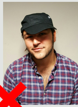
Too far away, hat obscuring forehead, shadows on face